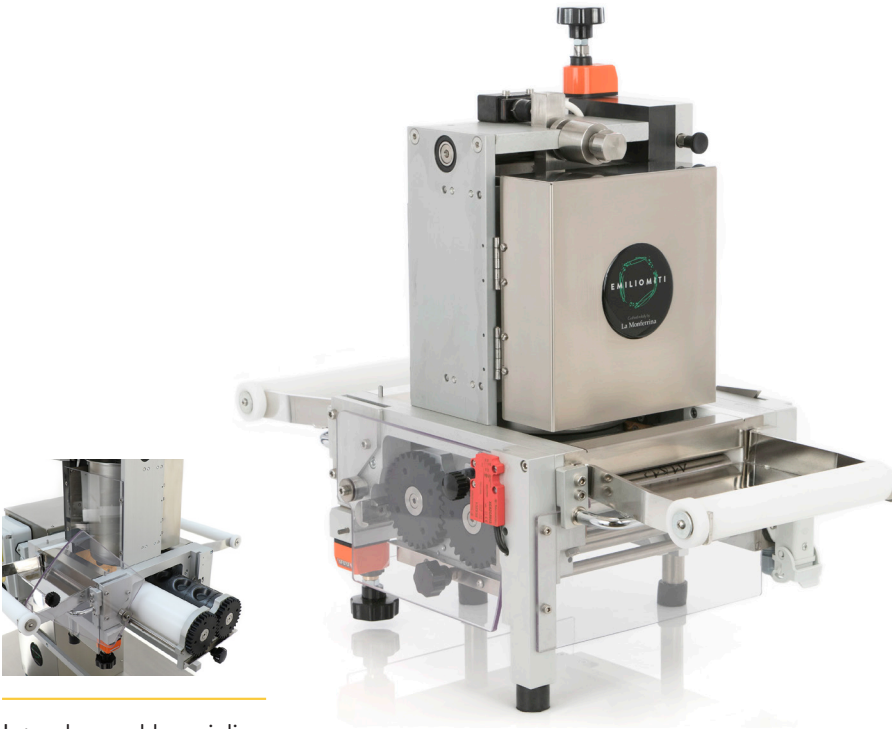
Interchangeable ravioli moulds