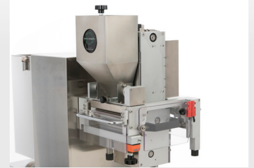
Optional gnocchi attachment